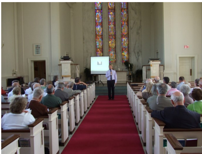
Rushton lecture, 1 June 2013

affairs were efficiently conducted, and we departed with the usual wonderful spirit of Christian faith, hope and love.