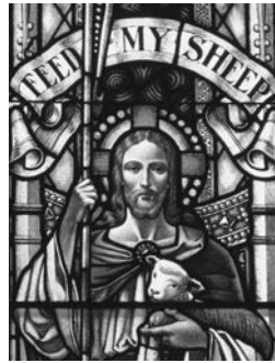
Wolfville Baptist Church (detail)

I never cease to be amazed that The Sharing Way has so embedded itself in Canadian Baptist life. There is still what the pundits would call 'brand recognition'. And it's more than 35 years since it was born! It's true that Canadian Baptist Ministries has set the banner aside, but the programmes they promote are overwhelmingly what The Sharing Way always sought to be and to do. I was there at the beginning of what became a significant chapter on our Canadian Baptist story. In those first